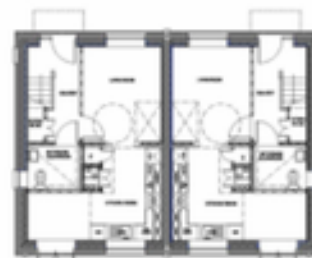
Proposed 1st Floor Plan