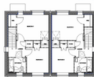
Proposed 1st Floor Plan