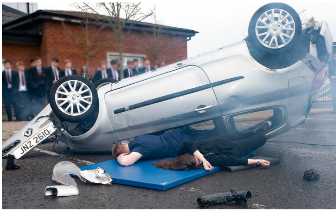
Photo - Road Safe Road Show at St Columbanus College, Bangor, November 2018

The PCSP sub theme of Road Safety saw a Speed Indicator Device (SID) deployed 18 times and some SID awareness sessions involving mini SID were held in local schools. There were reports of a decrease in speeding in the areas where SID was deployed in the month following deployment.