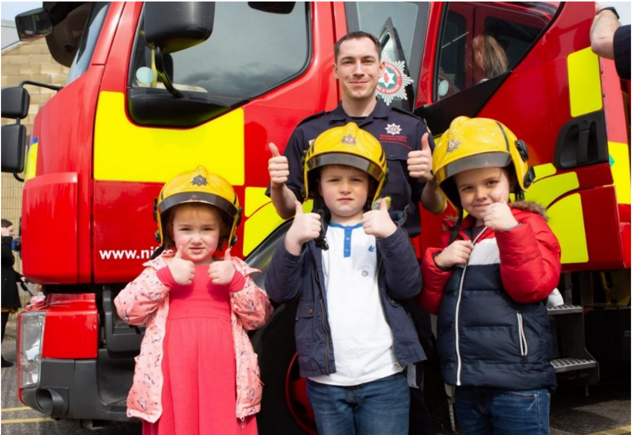
The Community Safety Fun Day held at Elim Complex, Bangor, March 2019

In February 2019 the new AND PCSP 2019/ 2022 Strategy and one-year Action Plan was submitted to the Department of Justice and approved. This Plan will guide the PCSP through the next three years which will include the PCSP reconstitution following the Local Government elections in May 2019 and the appointment of new Independent members in 2020.