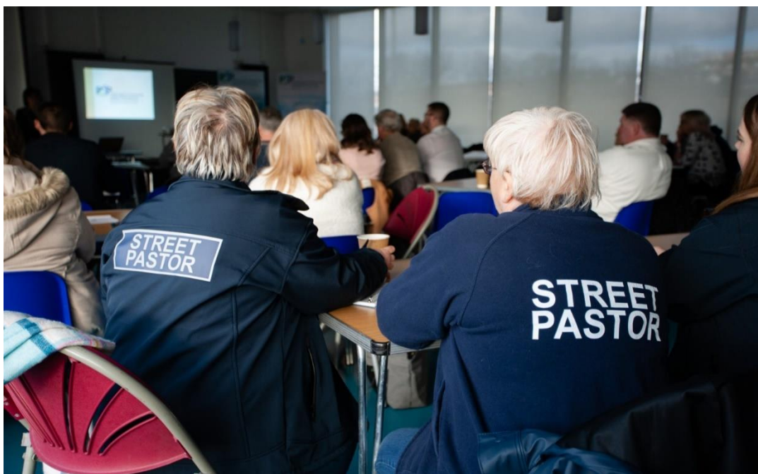
Photo – Our PCSP ran a public consultation to help shape its three-year strategy, January 2019

The PCSP also ran a P7 Bee Safe events at Ards Blaire Mayne leisure centre with 1855 pupils attending from 46 local primary schools. 100% of those attending reported a change in attitudes to risks and an understanding of agencies involved in criminal justice.