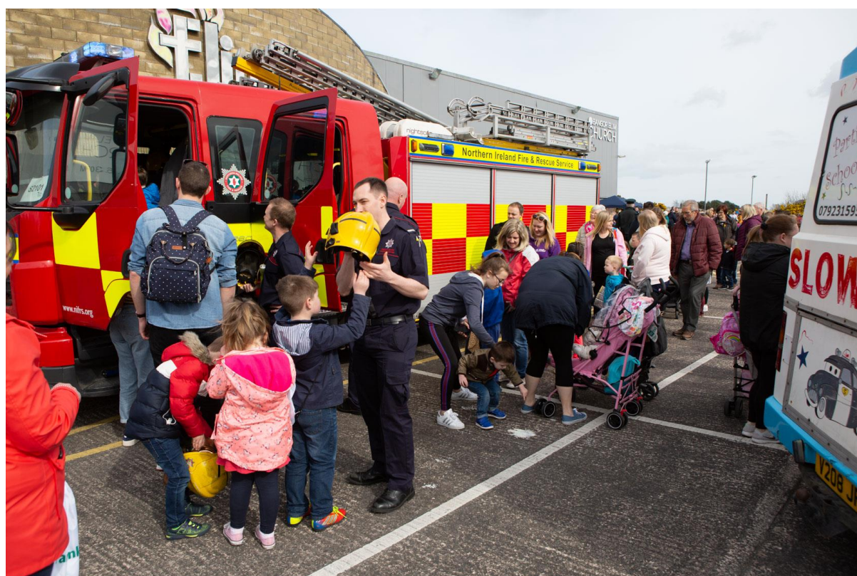
Photo – Community Safety Fun Day at Bangor Elim Complex, March 2019