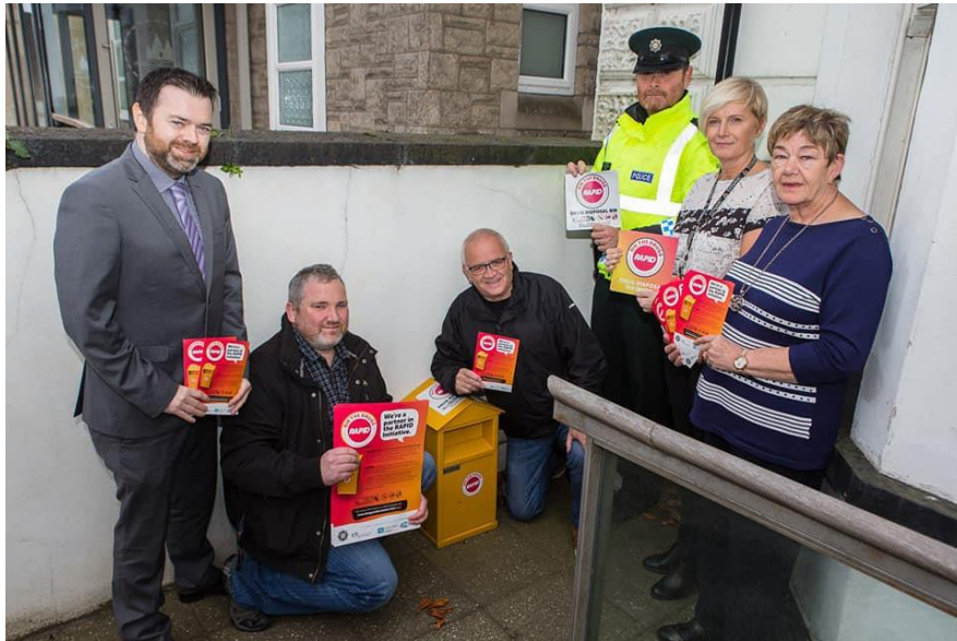
Photo – Launch of the PCSP’s RAPID bin in Newtownards, October 2018