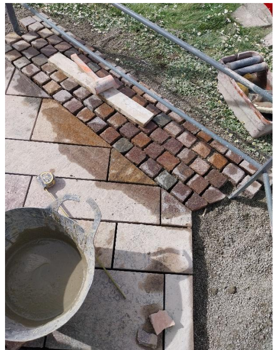
Intricate cobbling taking place in and around Market Square as the paving design begins to take shape