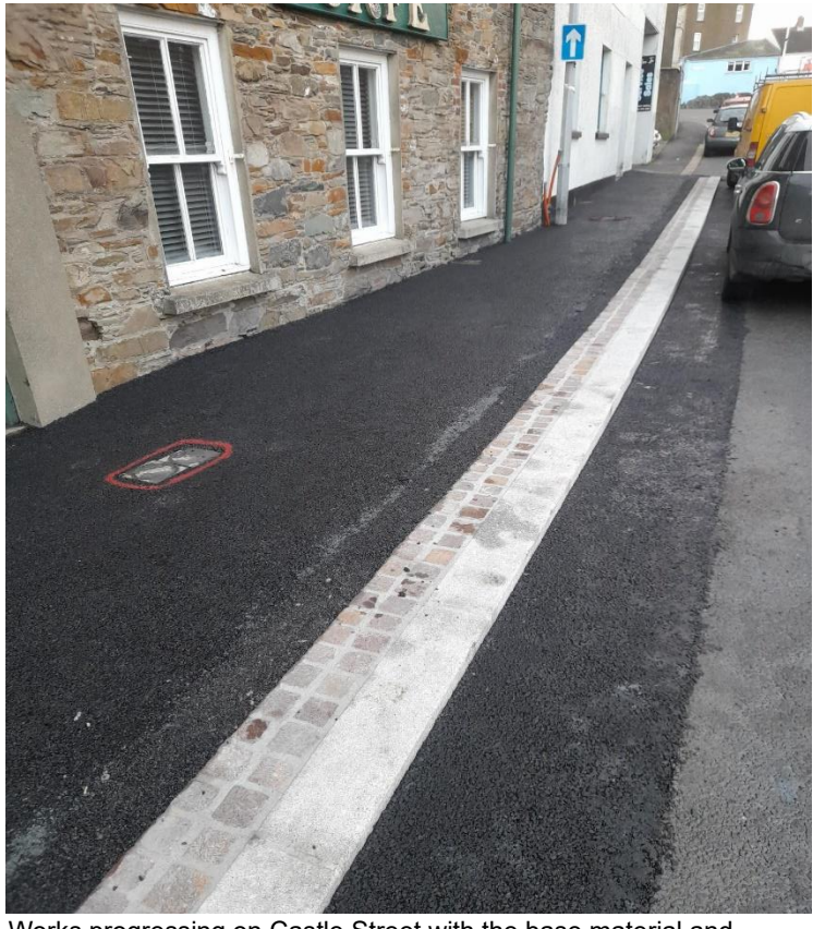
Works progressing on Castle Street with the base material and porphyry band laid

Welcome to the sixth newsletter for the Portaferry Public Realm Scheme. Newsletters will be issued fortnightly as works progress to keep residents and businesses updated on progress and future work schedules. You can register to receive these newsletters by emailing 'SUBSCRIBE' to portaferrypublicrealm@ardsandnorthdown.gov.uk. Alternatively, printed newsletters will be delivered to Exploris, Portaferry Library and Portaferry Post Office and can be picked up from there by anyone interested in the scheme who does not have access to email.