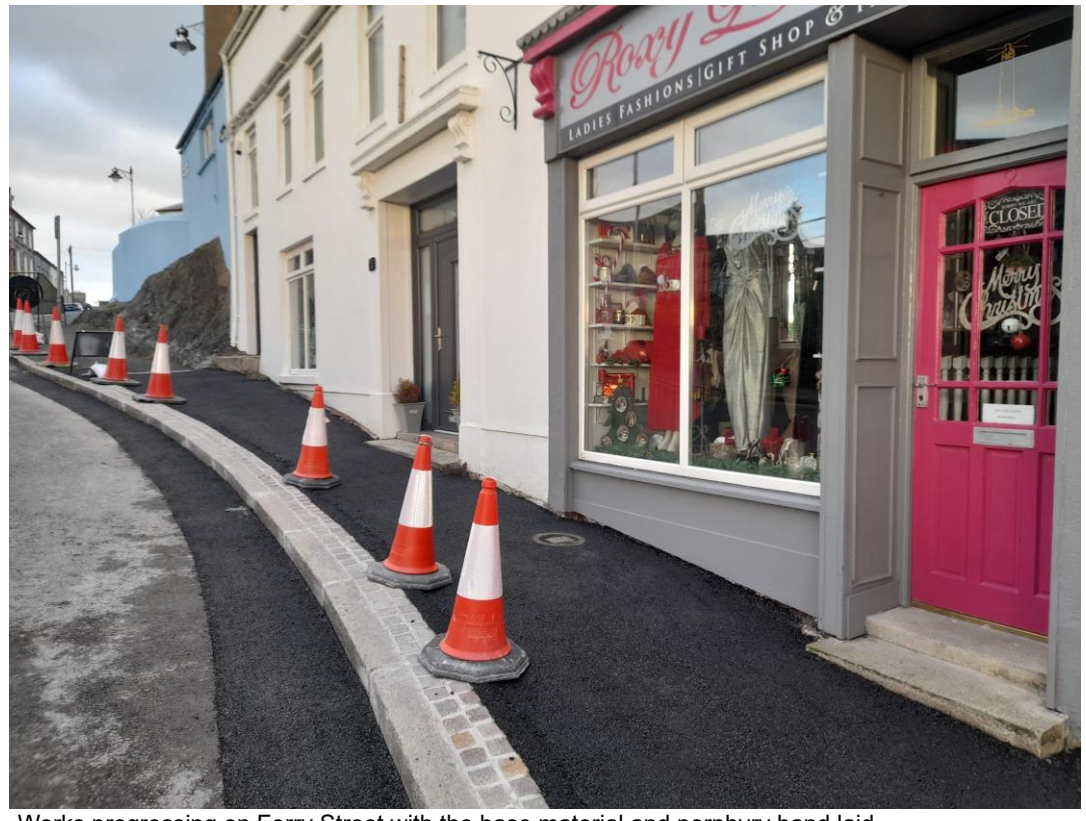
Works progressing on Ferry Street with the base material and porphyry band laid

Welcome to the fifth newsletter for the Portaferry Public Realm Scheme. Newsletters will be issued fortnightly as works progress to keep residents and businesses updated on progress and future work schedules. You can register to receive these newsletters by emailing 'SUBSCRIBE' to portaferrypublicrealm@ardsandnorthdown.gov.uk. Alternatively, printed newsletters will be delivered to Exploris and can be picked up from there by anyone interested in the scheme who does not have access to email.