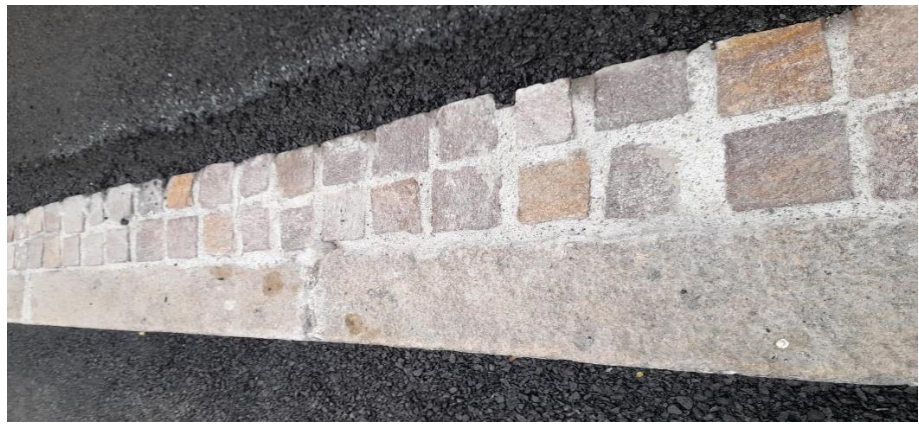
Close up of a section of the porphyry band in the pavement on Ferry Street