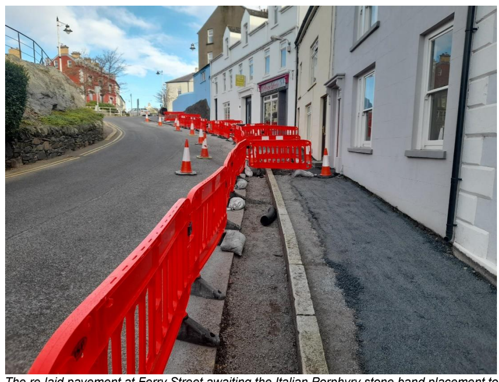
The re-laid pavement at Ferry Street awaiting the Italian Porphyry stone band placement to be installed on the left section of the above pavement image

Welcome to the fourth newsletter for the Portaferry Public Realm Scheme. Newsletters will be issued fortnightly as works progress to keep residents and businesses updated on progress and future work schedules. You can register to receive these newsletters by emailing 'SUBSCRIBE' to portaferrypublicrealm@ardsandnorthdown.gov.uk. Alternatively, printed newsletters will be delivered to Exploris and can be picked up from there by anyone interested in the scheme who does not have access to email.