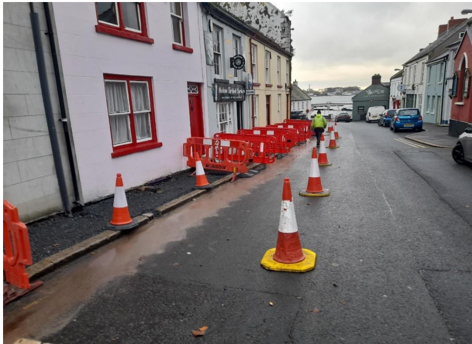
Works begin on Ferry Street

Welcome to the third newsletter for the Portaferry Public Realm Scheme. Newsletters will be issued fortnightly as works progress to keep residents and businesses updated on progress and future work schedules. You can register to receive these newsletters by emailing 'SUBSCRIBE' to portaferrypublicrealm@ardsandnorthdown.gov.uk . Alternatively, printed newsletters will be delivered to Exploris and can be picked up from there by anyone interested in the scheme who does not have access to email.