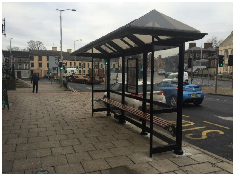
Bus shelter of similar style to that which will be installed at Market Square

The Bus Shelter at Market Square will be replaced as part of the Public Realm Scheme. The new shelter will be of a heritage style to be in keeping with Portaferry's heritage aesthetic. The shelter will be an aluminium structure (black powder coated) with transparent roof panels and toughened glass / polycarbonate.